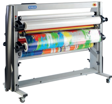
Front and rear view in a Roll to Roll configuration Included options Gas lift, LED light kit and in line slitting